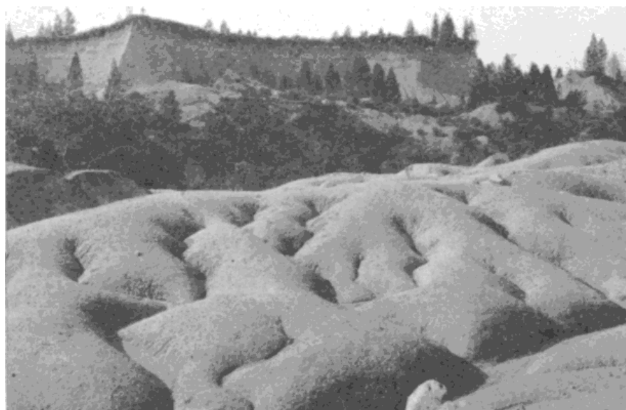
Figure 2 - Miniature hills, illustrating the convexity of divides and interstream ridges.

If soil creep and carriage by water are the only important processes of transportation operative in a region of maturely sculptured hills, the above analysis seems adequate. On the upper slopes, where water currents are weak, soil creep dominates and the profiles are convex. On lower slopes water flow dominates and profiles are concave. Other factors may be mentioned, but it is probable that they acquire prominence only in special cases.