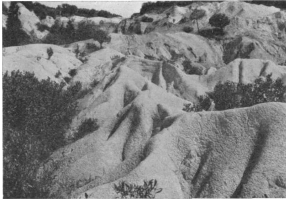
Figure 4 - Miniature hills, illustrating the convexity of divides.

Figs. 2, 3, and 4 show mature hill forms developed in homogeneous material. They occur on the floors of hydraulic gold mines at Nevada City, California. The washing away of the auriferous gravels laid bare tracts of decomposed granite in which the feldspars are largely changed to kaolin, and for about twenty years these have been exposed to the elements. There can be little question that here the convexities are due to creep; and the miniature topography illustrates strikingly the contrast between creep and stream work; but the conditions are not so near to normal as to make the forms fully representative. The kaolin is so cohesive when wet as to tolerate slopes far above the "angle of repose," and this leads to an exaggerated expression of the convex profile, shown especially in Fig. 2; and in the other examples there is reason to believe that the positions of gullies were largely determined by shrinkage cracks.