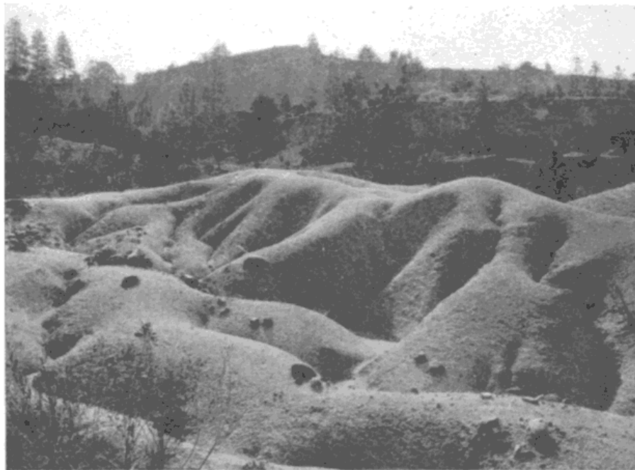
Figure 3 -Miniature hills, illustrating the convexity of divides.

There is an indirect effect of rain beat due to its combination with water flow and this follows the direction of water flow. When raindrops beat heavily on the upper slopes there is usually also a diffused flow of water. Particles disturbed by the drops are momentarily suspended by the flowing water and drifted down the slope. Near the summit such transportation is favored by the shallowness of the water sheet but restricted by the slowness of the current. Lower down it is favored by more rapid current but restricted by depth of water, which lessens the effect of impact. Whether the ordinary result is greater transportation near the divides, tending to produce a convex profile, or greater transportation on lower slopes, tending to produce a concave profile, is not easy to see.