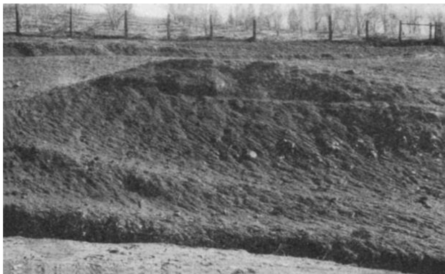
Figure 5 - Erosion and sculpture by the beating of raindrops. The material is regolith, exposed in a road cutting. The rain was driven by a strong wind so as to strike the ground in an obliquely ascending direction, from right to left.

Figs. 2, 3, and 4 show mature hill forms developed in homogeneous material. They occur on the floors of hydraulic gold mines at Nevada City, California. The washing away of the auriferous gravels laid bare tracts of decomposed granite in which the feldspars are largely changed to kaolin, and for about twenty years these have been exposed to the elements. There can be little question that here the convexities are due to creep; and the miniature topography illustrates strikingly the contrast between creep and stream work; but the conditions are not so near to normal as to make the forms fully representative. The kaolin is so cohesive when wet as to tolerate slopes far above the "angle of repose," and this leads to an exaggerated expression of the convex profile, shown especially in Fig. 2; and in the other examples there is reason to believe that the positions of gullies were largely determined by shrinkage cracks.